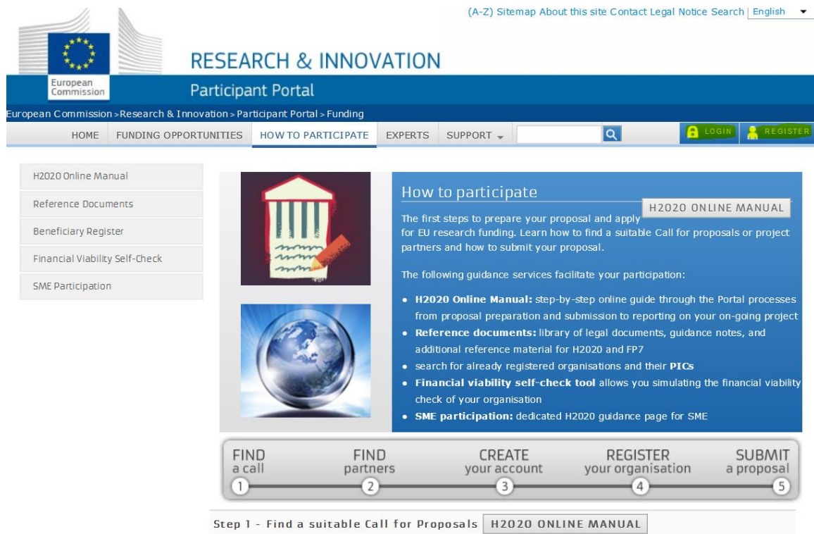
Figure 1: Screen shot of the Participant Portal homepage

You can see in the screen shot above that the homepage refers to registered and non-registered users.