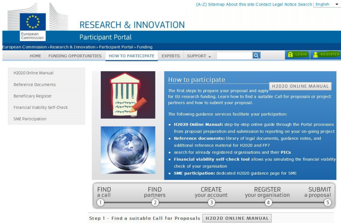
Figure 1: Screen shot of the Participant Portal homepage

You can see in the screen shot above that the homepage refers to registered and non-registered users.