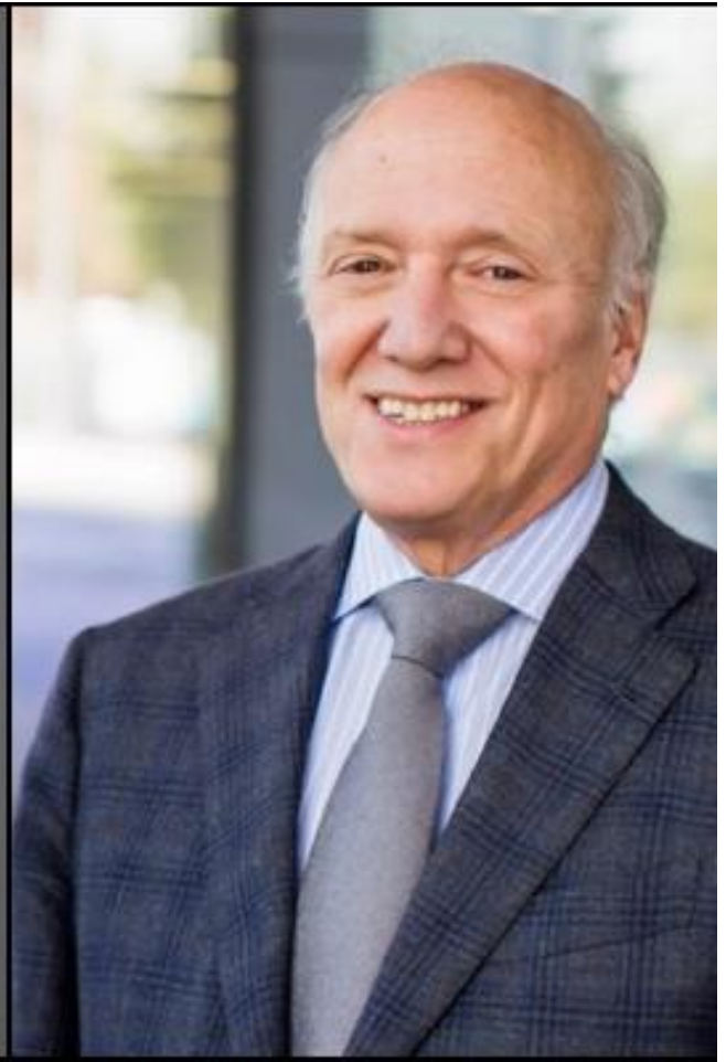
Book on Alzheimer's by Caltech Profesor Nears Publication July 22, 2021